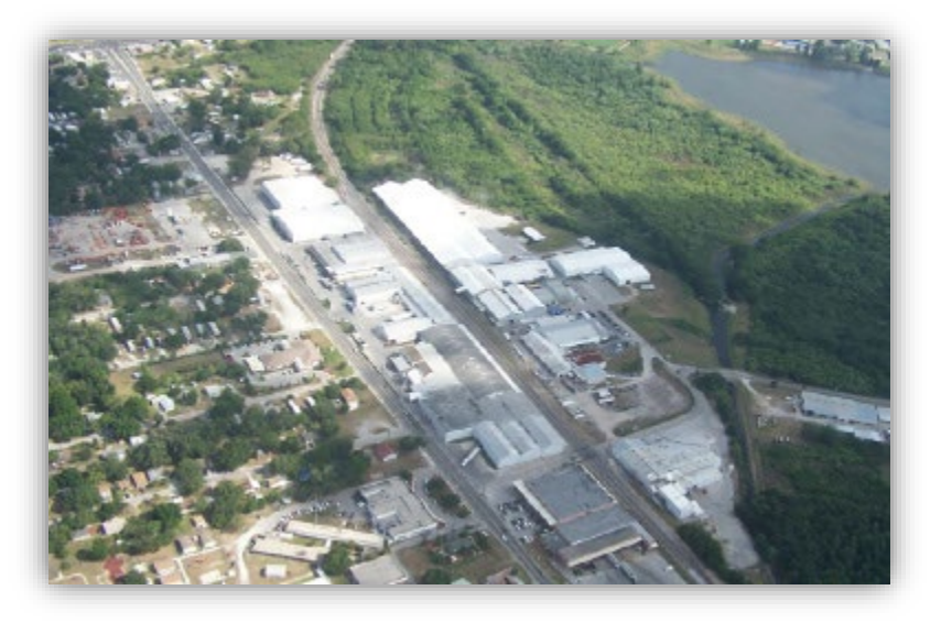
Figure 1 Eloise CRA Aerial View

Further, the Board of County Commissioners determined that 1) A shortage of housing of sound standards and design which is decent, safe, sanitary, and affordable to residents of low or moderate income, including the elderly, exists in the County; 2) The need for housing accommodations has increased in the area; and 3) The conditions of blight in the area or the shortages of decent, safe, affordable, and sanitary housing cause or contribute to an increase and spread of disease and crime or constitute a menace to the public health, safety, and welfare.