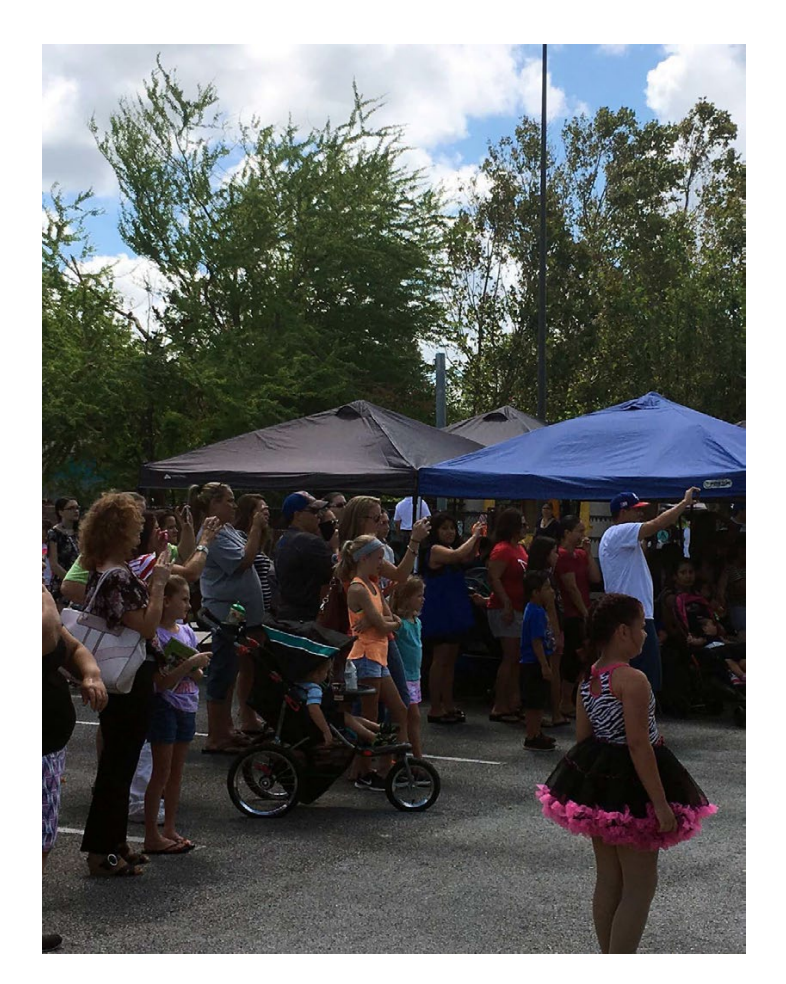
Figure 3 Eloise Community Event

approved. On June 5, 2018, the Agency Plan Amendment was presented to the CRA Board and was approved unanimously.