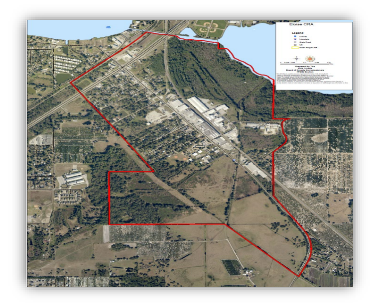
Figure 2 Eloise CRA Boundary Map

Additionally, to assist staff with implementing updated strategies to continue to resolve the blighting and slum that still exists, on April 5, 2018 the Eloise CRA Advisory Committee voted unanimously to approve an amendment to the Eloise CRA Plan. May 2, 2018 the plan was presented to the Polk County Planning Commission to review and determine consistency with the Polk County Comprehensive Plan. The amended Eloise CRA plan was found consistent with the Comprehensive Plan and was unanimously