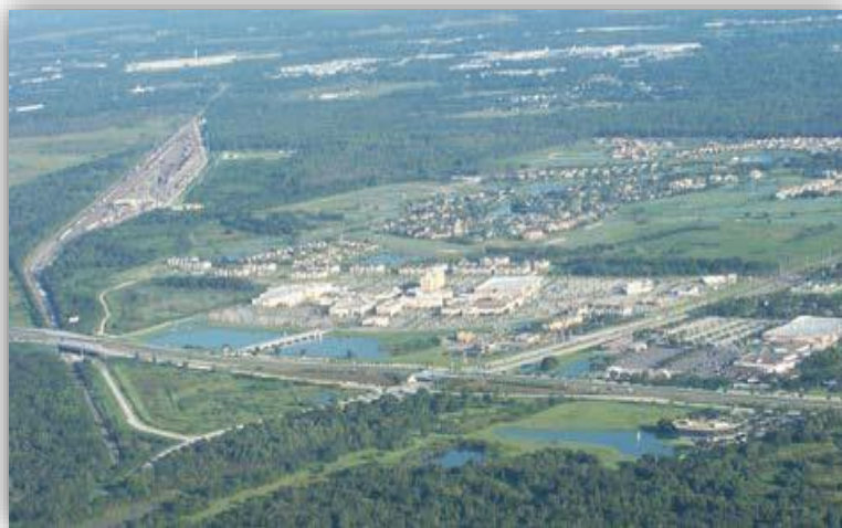
Figure 3 Harden/Parkway CRA Aerial View