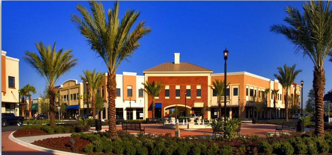
Figure 4 Harden/Parkway CRA, Lakeside Village

The Harden/Parkway CRA is in current debt repayment due to the County and City establishing an Interlocal Agreement to cooperate in creating this CRA, for the purpose of eliminating transportation system blight in the area as mentioned in Section II. The County borrowed the funds to complete transportation and roadway improvements prior to 2013.