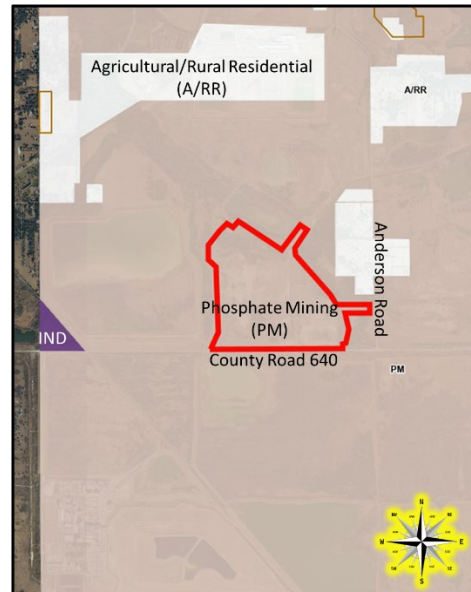
Current Future Land Use