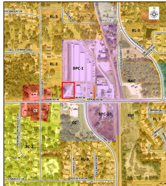
Current Future Land Use