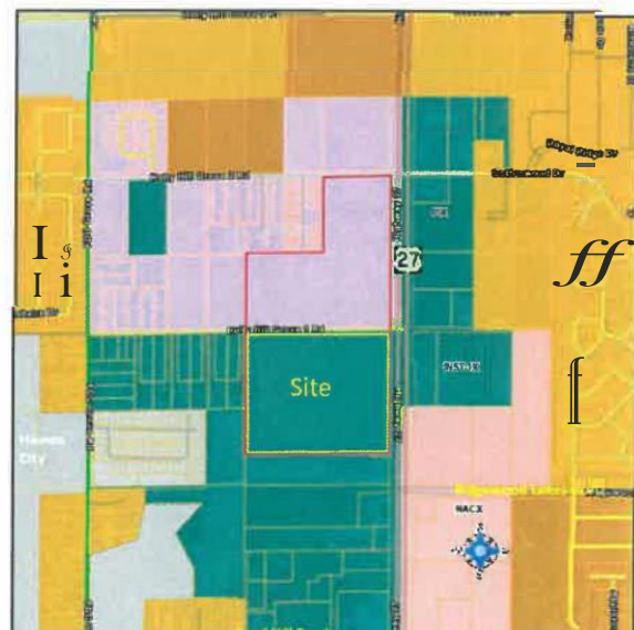
Current Future Land Use Map