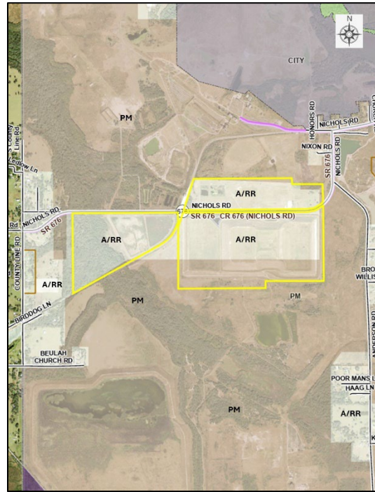
Current Future Land Use