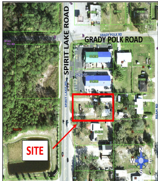
2023 Aerial Photo

This is an applicant-initiated Comprehensive map amendment to change a .44-acre parcel from Residential-Low 4 (RL-4) to Office Center (OC) on the Future Land Use Map.