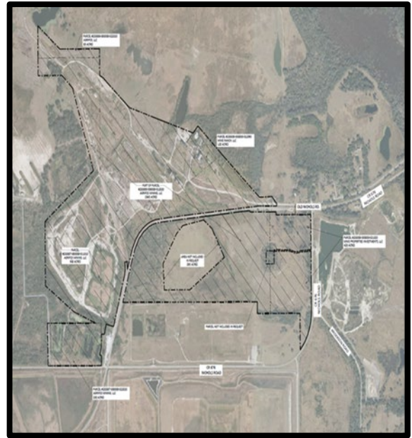
2023 Aerial Photo

This is an applicant-initiated Comprehensive map amendment to change 420 acres from Phosphate Mining (PM) & Agricultural/Residential-Rural (A/RR) to Industrial (IND) on the Future Land Use Map.