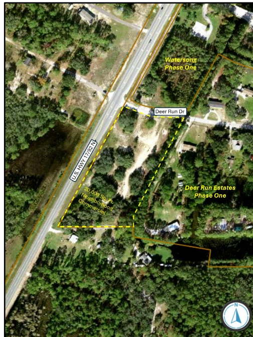
2024 Satellite Photo

The developer is requesting a Planned Development (PD) modification approval of 20,000 sq. ft. for neighborhood commercial use to the local community on approximately 4.19 acres within a Residential Low-1X (RL-1X) Future Land Use District in the North Ridge Selected Area Plan (SAP). Original Watersong PUD is vested for 5,000 sq. ft. neighborhood commercial.