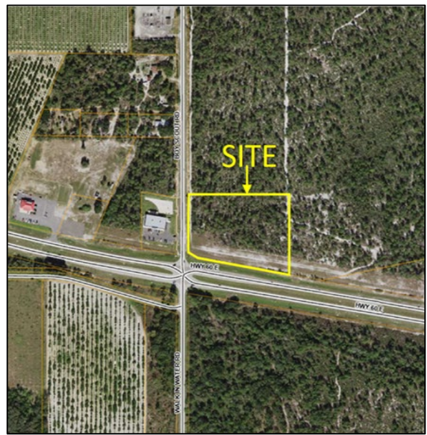
2023 Aerial Photo

This is an applicant-initiated Comprehensive map amendment to change 6.5 acres from Agricultural/Residential-Rural (A/RR) to Rural Cluster Center (RCC) on the Future Land Use Map. and to change the text of Section 2.135 of the Comprehensive Plan to allow for the adoption of the State Road 60 & Boy Scout Road RCC Activity Center Plan (ACP).