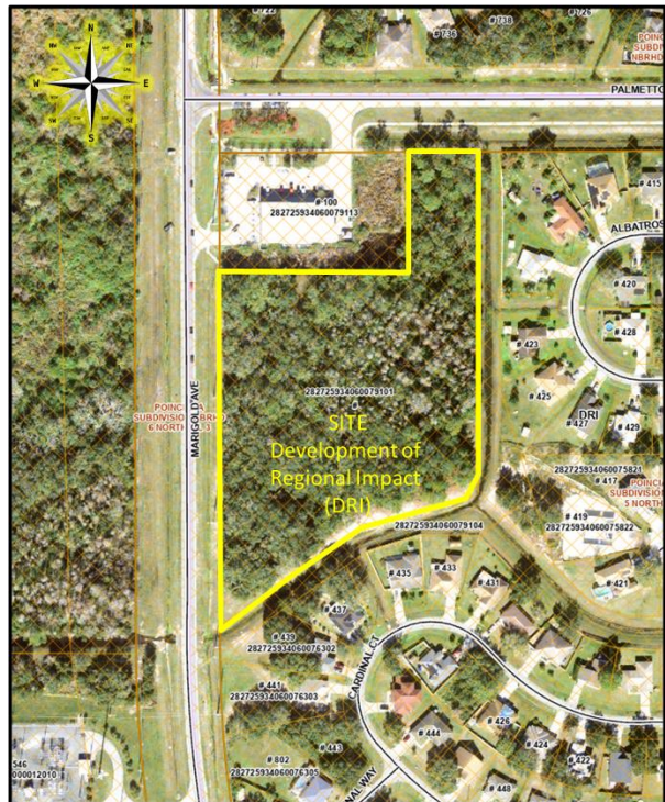
Current Land Use Map