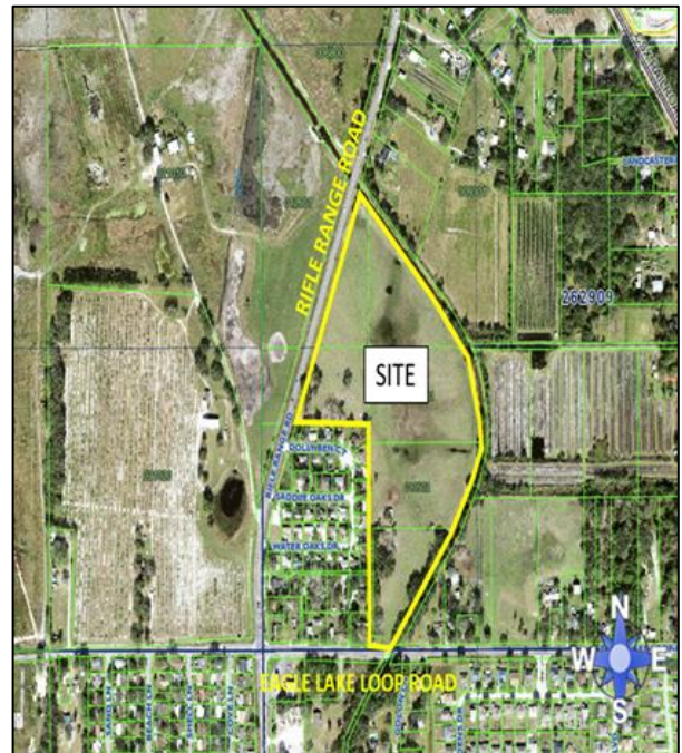
2023 Aerial Photo

This is an applicant-initiated Comprehensive map amendment to change 25 acres from Residential-Suburban (RS) to Residential-Low (RL) on the Future Land Use Map. and change the Development Area designation from Suburban Development Area (SDA) to Urban Growth Area (UGA).